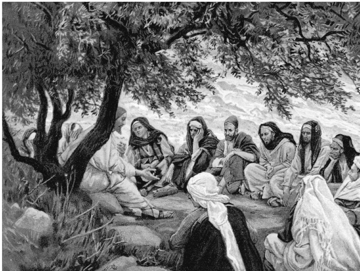
Christ's exhortation to the twelve Apostles, by James Tissot, 1856-1902

“Jesus is unbelievably insistent that he is life and that we must have his life within us.”